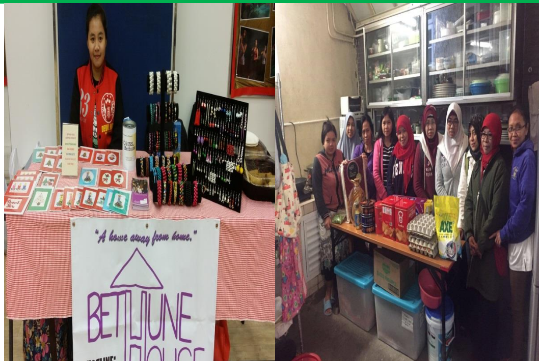
Handicraft Sale and Food Drive