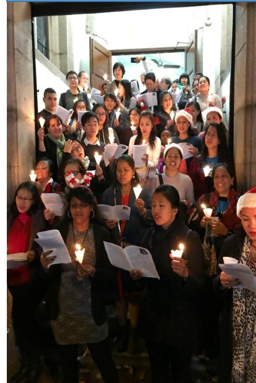
Singing at the Steps on Christmas Eve at KUC