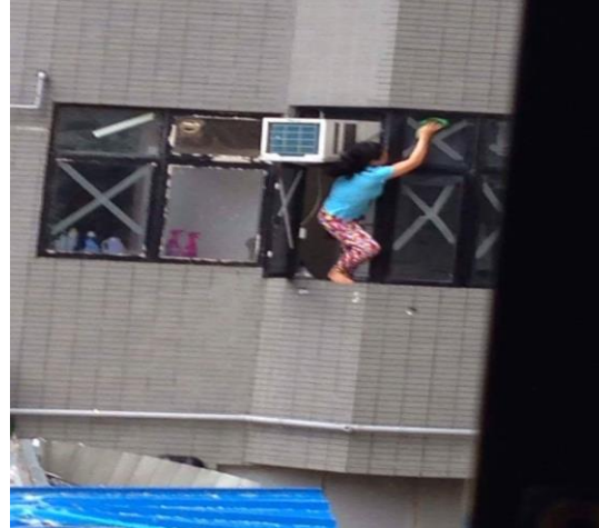
Window cleaning even during typhoon Hato